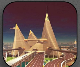
GUJARAT TRADE CENTER (GTC)