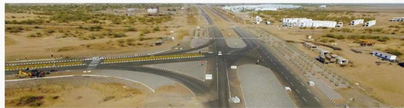
UPCOMING BIGGEST TOURIST HUB