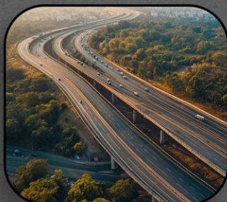
AHEMDABAD DHOLERA EXPRESSWAY (NE-8)