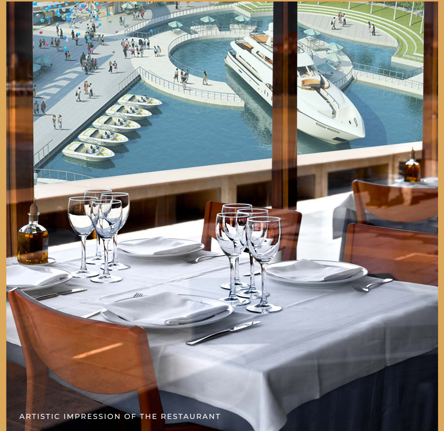
ARTISTIC IMPRESSION OF THE RESTAURANT