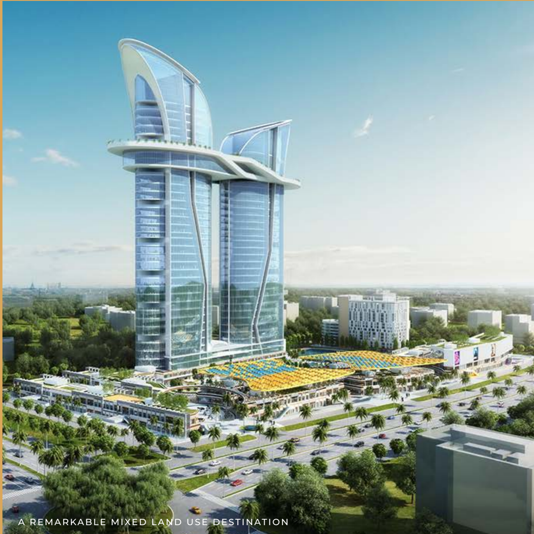
A REMARKABLE MIXED LAND USE DESTINATION