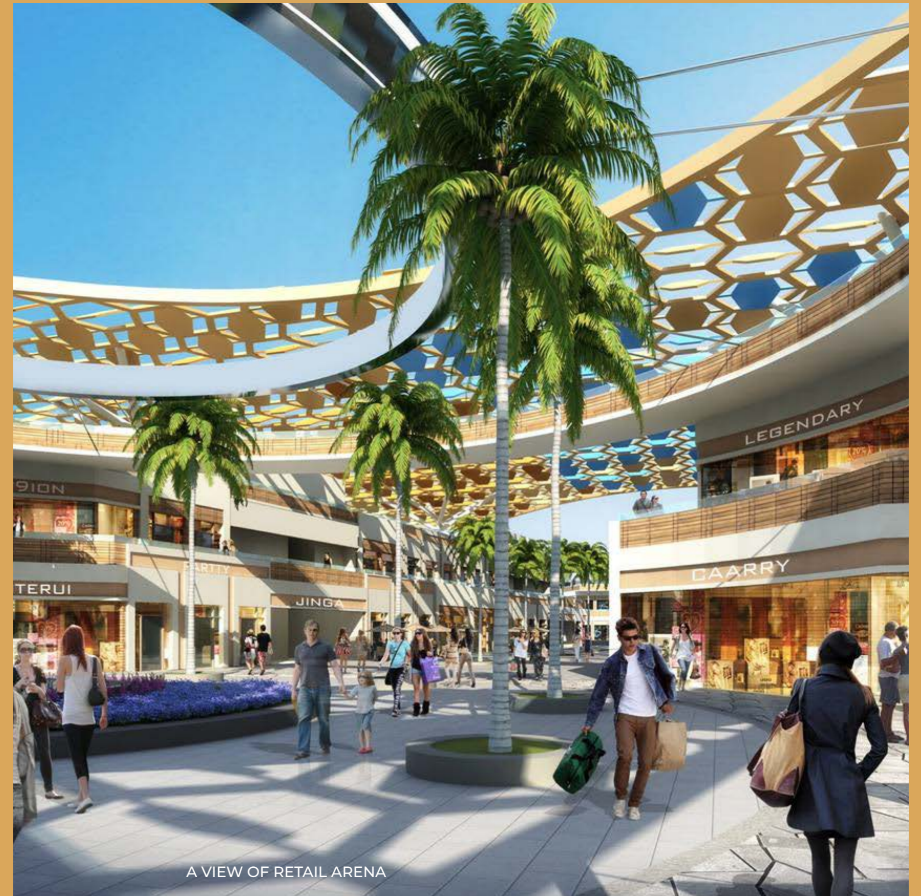
A VIEW OF RETAIL ARENA

The rides are being imported from Leading European companies which supply to Disney and Universal studio