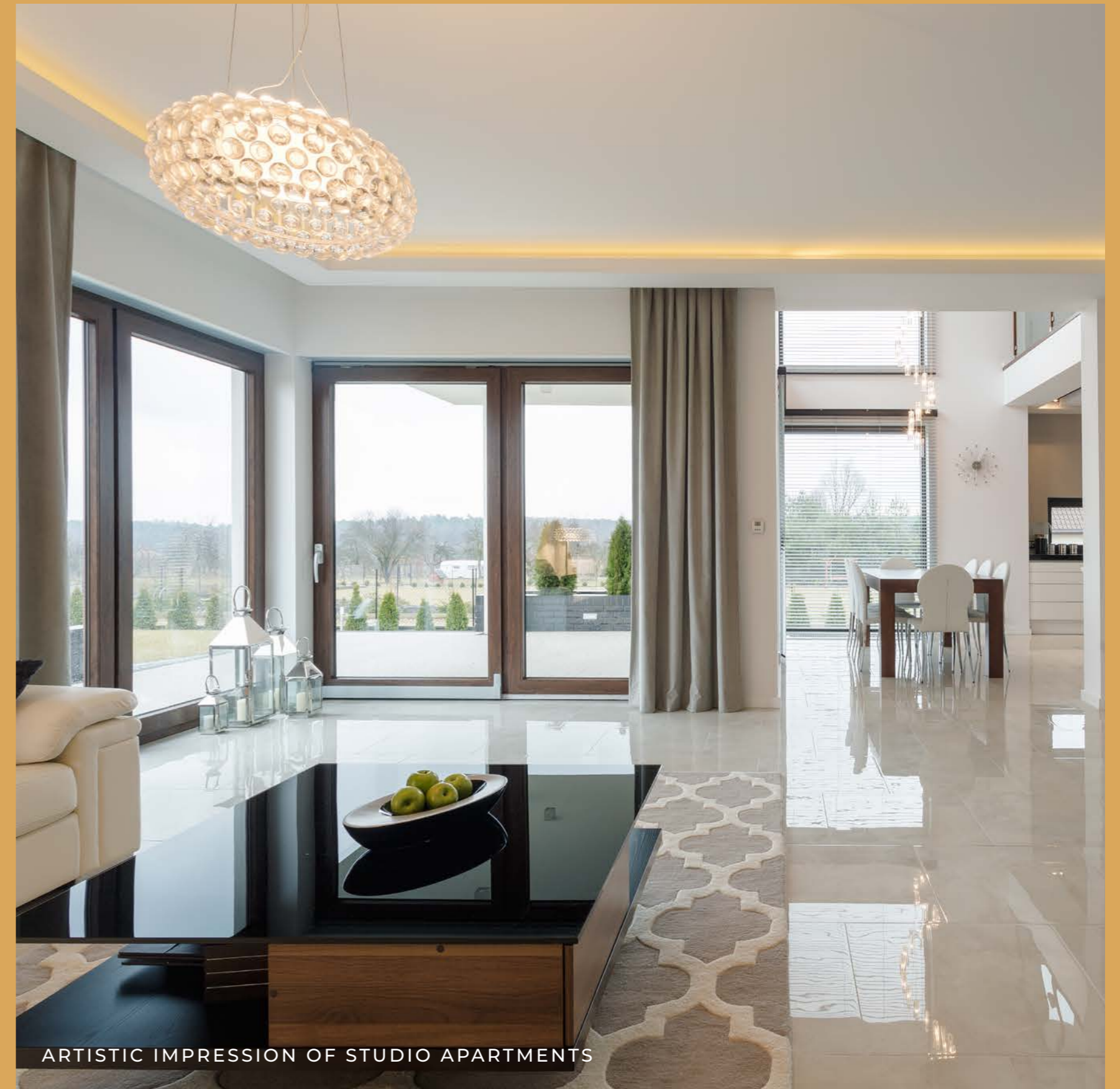
ARTISTIC IMPRESSION OF STUDIO APARTMENTS