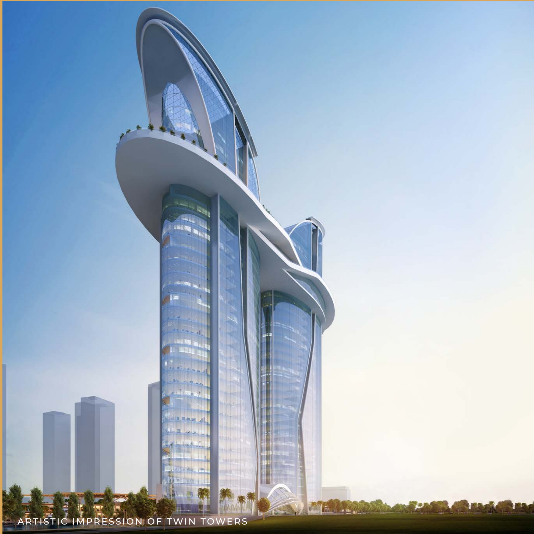
ARTISTIC IMPRESSION OF TWIN TOWERS