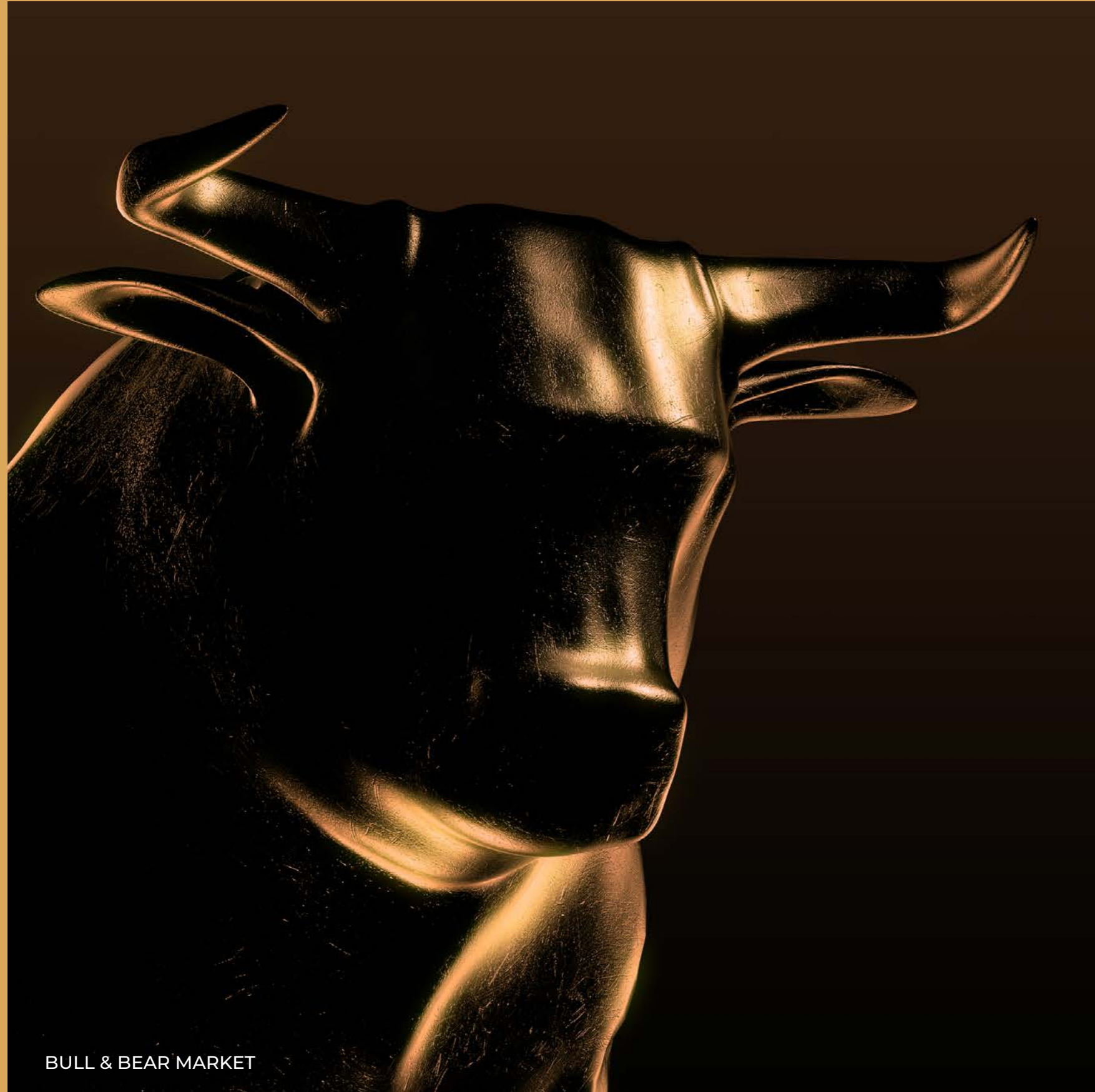
BULL & BEAR MARKET