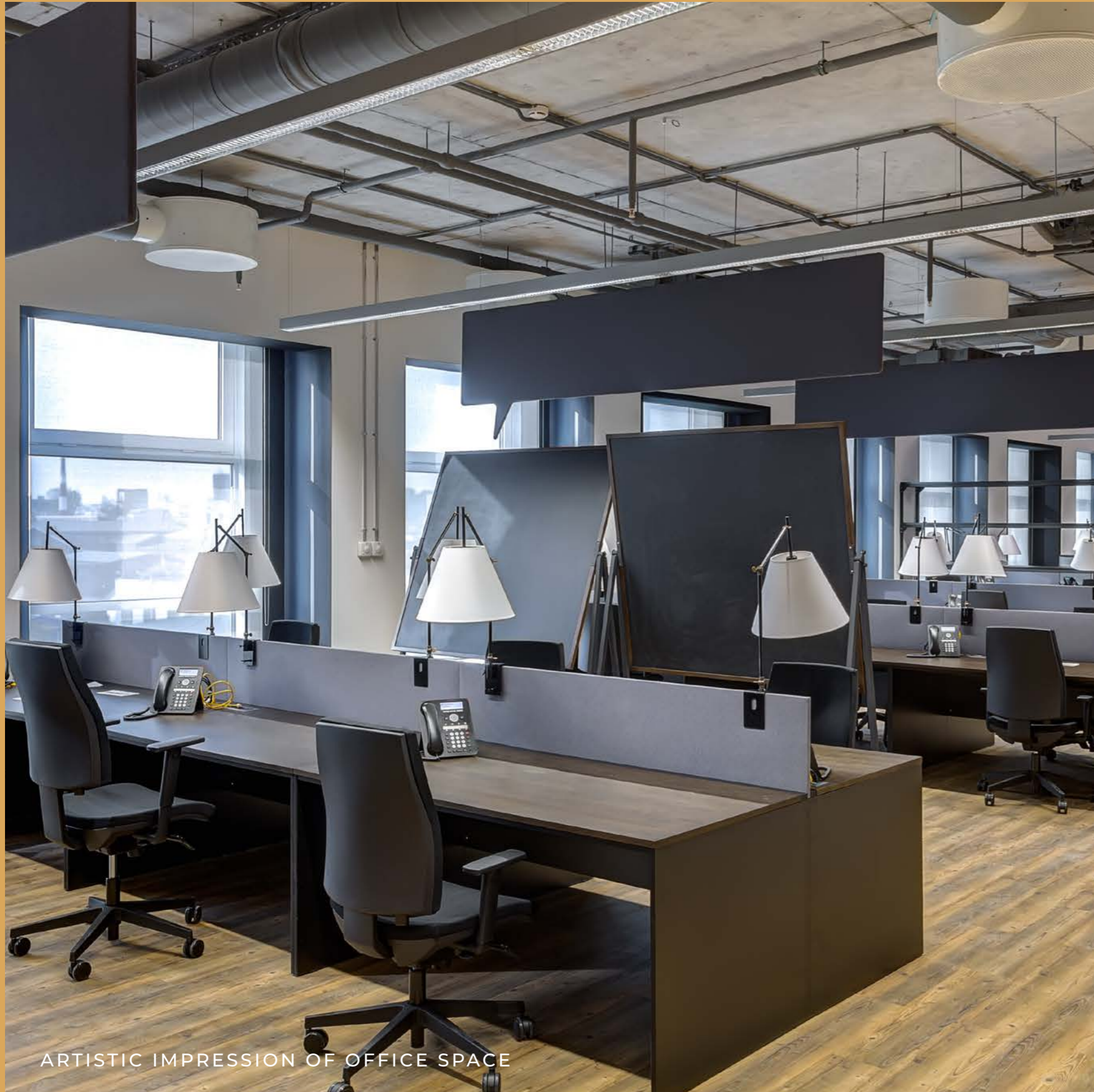
ARTISTIC IMPRESSION OF OFFICE SPACE