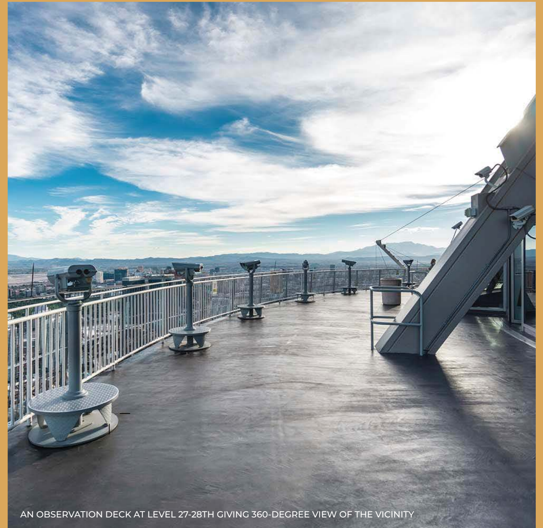
AN OBSERVATION DECK AT LEVEL 27-28TH GIVING 360-DEGREE VIEW OF THE VICINITY

By not surrounding the building with parking, connectivity to the rest of the Grandthum precinct is ensured.